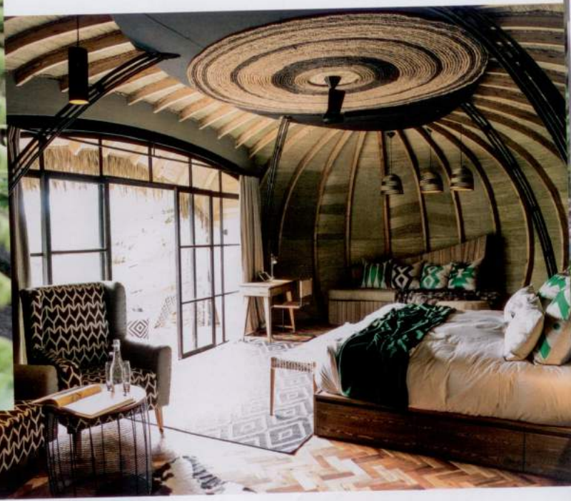
From top left: a mother and baby gorilla. One of Bisate Lodge's six luxury bedrooms with interiors that reflect its colourful locale. All rooms have fireplaces as the

Tracking gorillas isn't new – in fact, it's long been the reason most tourists come to Rwanda – but what is new is that for the first time Rwanda has a truly luxurious lodge. Until now, those longing to see these primates have had to rely on a host of nice but fairly simple places to stay in. But Wilderness Safaris – famed for its gorgeous lodges in seven other African countries (most notably perhaps across Botswana and Zimbabwe, as well as at North Island in the Seychelles) – has just opened a stunning six-bedroom lodge called Bisate (pictured on previous page) on the slope of a small hill some 15 minutes' drive from the